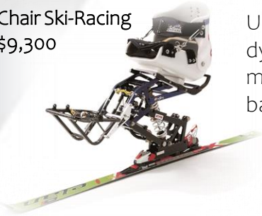
Chair Ski-Racing $9,300

Using an advanced algorithm, we have successfully implemented dynamic rotating and sliding motions. Achieve sharp turning movements and has lift-up lock mechanism. Seat bucket and ski base not provided.