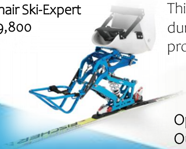
Chair Ski-Expert $9,800

This is a top-of-the-line system specific for sliding on snow . Very durable and made for competitions. Seat bucket and ski base not provide. *Lift-up lock mechanism not available for this model.