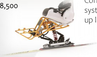
Chair Ski-Basic Advance $8,500

Consistent skiing for a variety of chair skiers. This is a widely used system that is supported by numerous sources. Has lift-up lock mechanism. Seat bucket and ski base not provided.